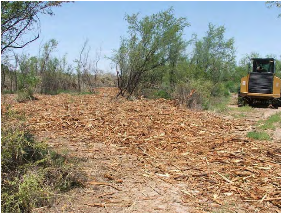
Rhodes tract extraction and mulching by Restoration Solutions, LLC