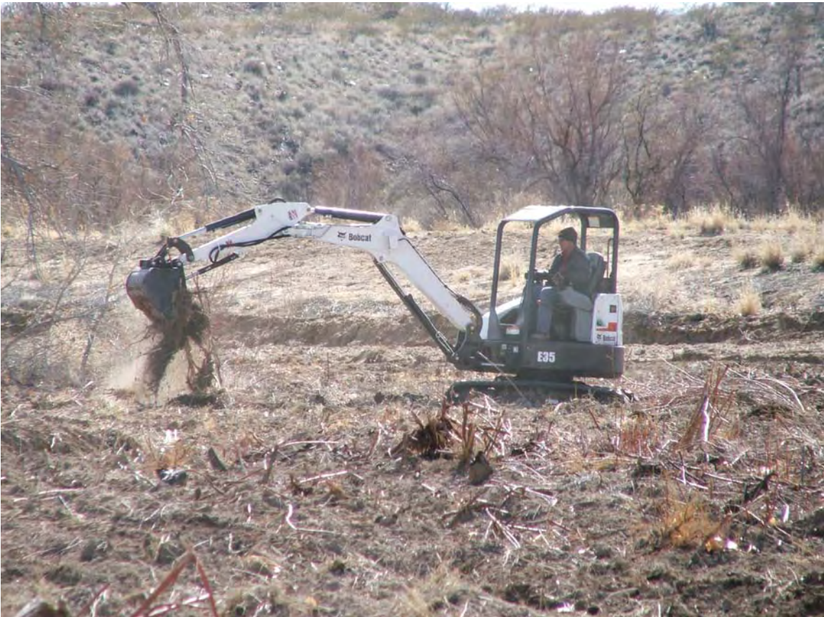
Bobcat E35 assisting in revegetation on Sevilleta National Wildlife Refuge

In February 2010, the Bobcat E35 was used to assist in re-vegetating and Salt cedar removal on Sevilleta National Wildlife Refuge. That month, 6,140 Gooding's black willow trees were planted. This particular species of tree is known for attracting the Southwestern willow flycatcher, an endangered species. The District had a contract with a local native species grower who grew these trees for three years before harvesting and delivering to Sevilleta for planting in February. This completed the Socorro SWCD's contract with the US Fish and Wildlife Service for the Management of Exotics for the Recovery of Endangered Species on Sevilleta National Wildlife Refuge.