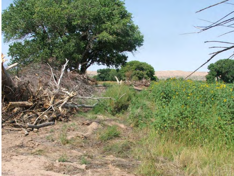
Tinnin tract piles prior to burning

The Socorro SWCD also received revegetation funding in the amount of $25,000 from Senator Bingaman. Following NRCS specifications for planting, 11.7 acres was restored on the Tinnin tract near the Ladd S Gordon Refuge complex in Bernardo, NM. This tract contained strips of Salt cedar approximately 75 feet in width between alfalfa and pasture fields. The standing dead Salt cedar was extracted into piles and burned. Natives were left in place. The Socorro SWCD then planted 400 Bighorn skunkbush, 100 Desert false indigo, 300 Jemez Stretchberry, 40 Littleleaf sumac, and 20 Netleaf hackberry in these strips.