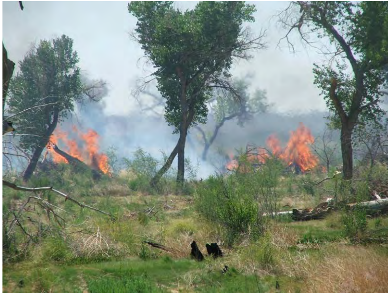
Pile burning at Rhodes tract by ASAP Wildfire Suppression, LLC

The Socorro SWCD also completed a $150,000 grant from NM State Forestry. This was used to pile and burn standing, dead Cottonwoods and extracted Salt cedar on 65 acres on the Rhodes tract in Bosquecito, NM. This burning contract was issued to ASAP Wildfire Suppression, LLC. The District also contracted with Restoration Solutions, LLC for the extraction and mulching of 15.6 acres of live Salt cedar along the Rio Grande on the Rhodes tract. Following this mechanical work, the District contracted with L and J Construction, Inc. to have 5,280 feet of wildlife friendly fence installed.