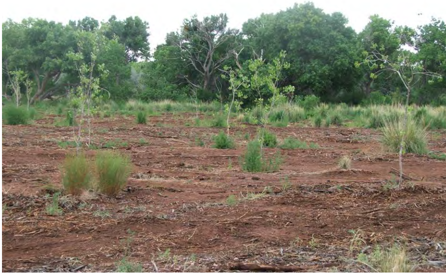
Cottonwood poles on the Holmes tract

The Socorro SWCD also entered into a US Fish and Wildlife Service Partners for Fish and Wildlife Service Agreement to be the cooperating manager on the Holmes tract in Pueblito, NM. In February 2010, the Socorro SWCD planted 109 Rio Grande cottonwoods and extracted all the Salt cedar resprouts on 21 acres.