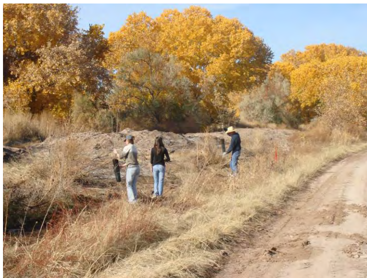
Planting of native species on Tinnin Tract in Bosquecito, NM