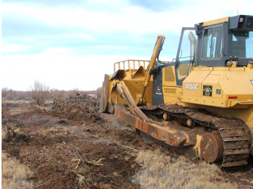
ASAP Wildfire Suppression, LLC working on one of the tracts in La Joya, NM

The Socorro SWCD received $36,558 in Capitol Outlay Funding for Salt cedar treatment and revegetation along the Rio Grande. This year this funding was used to have 73.1 acres of standing dead Salt cedar pushed into piles by a bulldozer. This contract went to ASAP Wildfire Suppression, LLC. This was on two private landowner tracts in La Joya, NM. Both owners were willing to burn the piles and planned to land level and go into crop production after the Salt cedar removal. The Socorro SWCD will return in February of 2011 to plant cottonwoods.